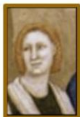
Vice Minister Karron Esmonde, OFS