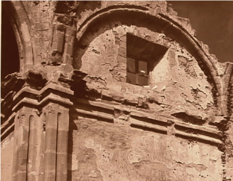
Swallows nesting under the arch of the Great Stone Church ruins

Famously for many years, we have heard of the swallows returning yearly to Mission San Juan Capistrano on St Joseph's Day. Interestingly, the swallows leave the Mission October 23 rd on the Memorial of the Franciscan Saint John of Capistrano. Somewhere along the line God must have His hand in all of this. And once again on March 19 th , the Church will celebrate the annual Solemnity of St Joseph, Spouse of the Blessed Virgin Mary. This year, it also happens to be the first day of spring which is bringing new life. Having lived in Mission Viejo with my family in the late 70's and 80's while operating my car business in San Clemente, quite often I frequented Mission San Juan Capistrano. During this time, I became curious as to know if the swallows really did return to