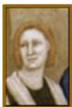
Vice Minister Karron Esmonde, OFS