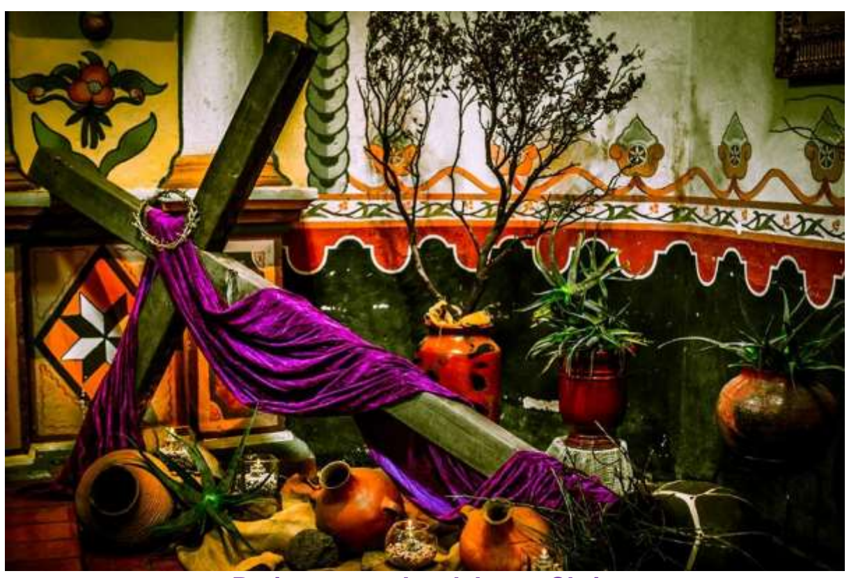
Praise to you Lord Jesus Christ.

We adore you, O Christ, and praise you. Because by your holy Cross you have redeemed the world.