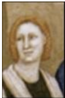
Vice Minister Karron Esmonde OFS