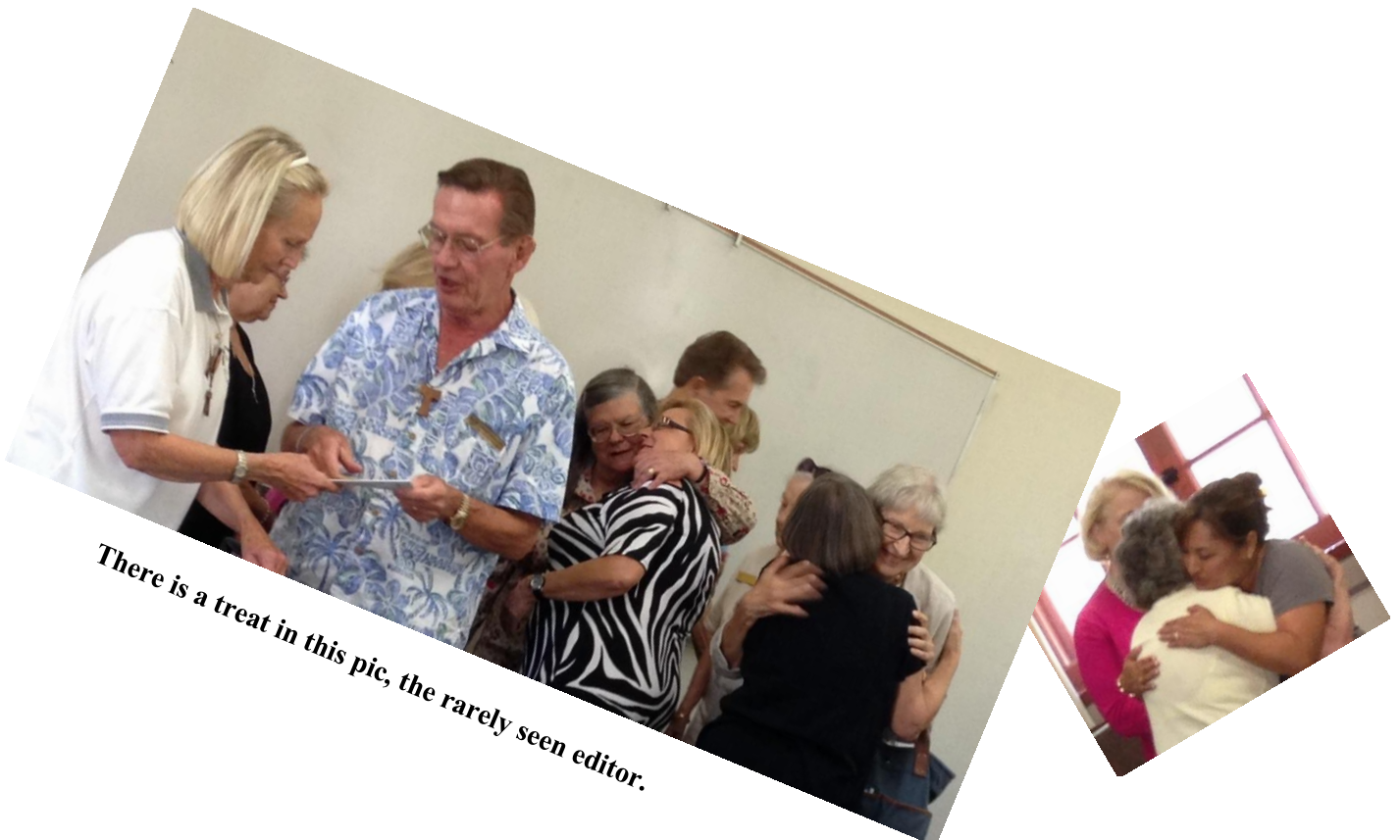
There is a treat in this pic, the rarely seen editor.