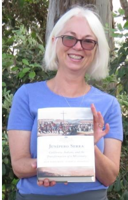
With a favorite book

"I give thanks to my God every time I remember you, praying always with joy in my every prayer for you, because of your partnership for the Gospel from the first day until now. I am confident of this, that the One who began a good work in you will continue to complete it until the day of Christ Jesus." (Philippians 1:3-11)