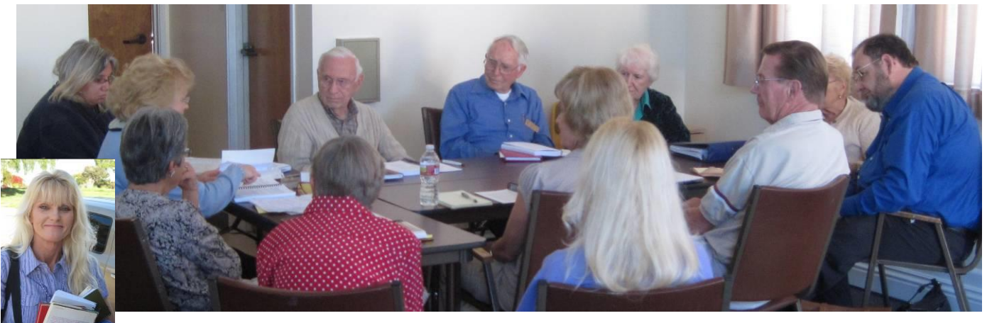
Our formation group, with some professed observers, on Sunday, March 4, 2012.