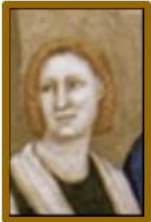
Vice Minister Karron Esmonde, OFS