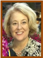
Minister Laura, OFS