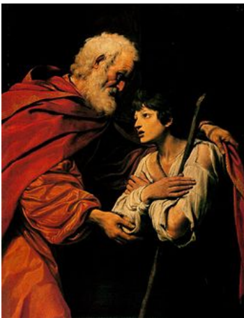
The Return of the Prodigal Son (Leonello Spada, Louvre, Paris)

Contemplative religious orders, like the Poor Clares and Carmelites , live their whole life in a cloister, an enclosure that separates them from the outside world. Their focus is on the inner life. Their work is prayer 6 to 8 hours a day in community plus private prayers. These communities are powerhouses of prayer; a spiritual force to reckon with. Vocations have been diminishing as the opportunities and riches of the outside world increased. We've been praying for more vocations. Suddenly, the whole world became a cloister. Watch what you pray for! Lock downs, and sheltering in place have become the norm for the past year. To many it feels a chastisement or even imprisonment. Perhaps in these challenging times when we can't freely travel the world because we are requested to stay at home, we should turn inward, and discover the beauty and joy of our inner world, seek God who is love, and listen to him. This is our opportunity to build a stronger loving relationship with our Heavenly Father.