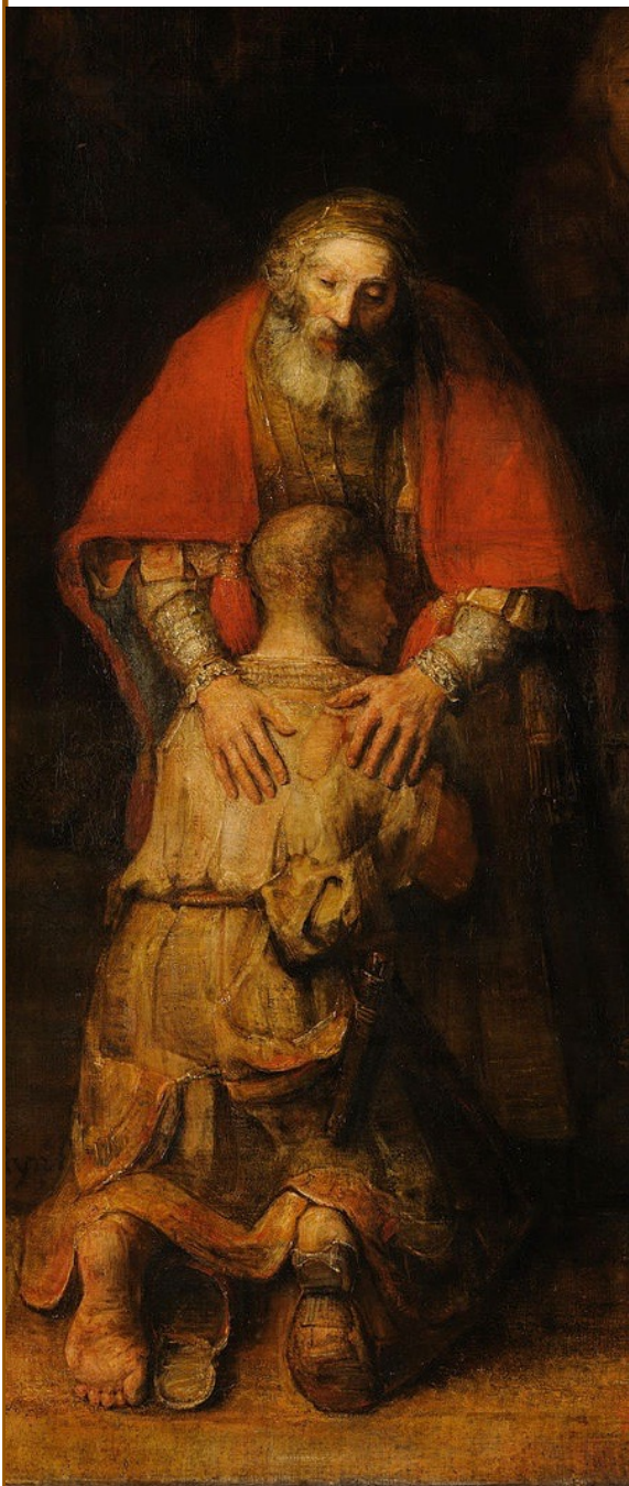
Rembrandt, "The Return of the Prodigal Son" 1662-1669 ( Hermitage Museum, St Petersburg )