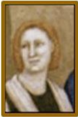
Vice Minister Karron Esmonde, OFS