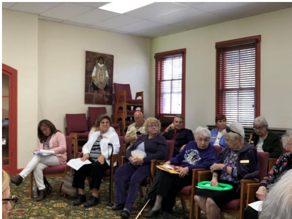
Great presentation Brother..., we're taking notes.