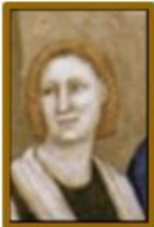
Vice Minister Karron Esmonde, OFS