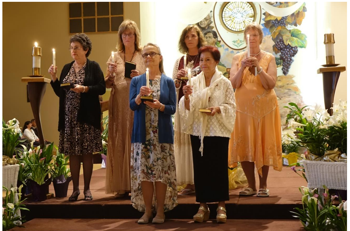
Our newly Professed Secular Franciscans... God Bless Them now and forever.