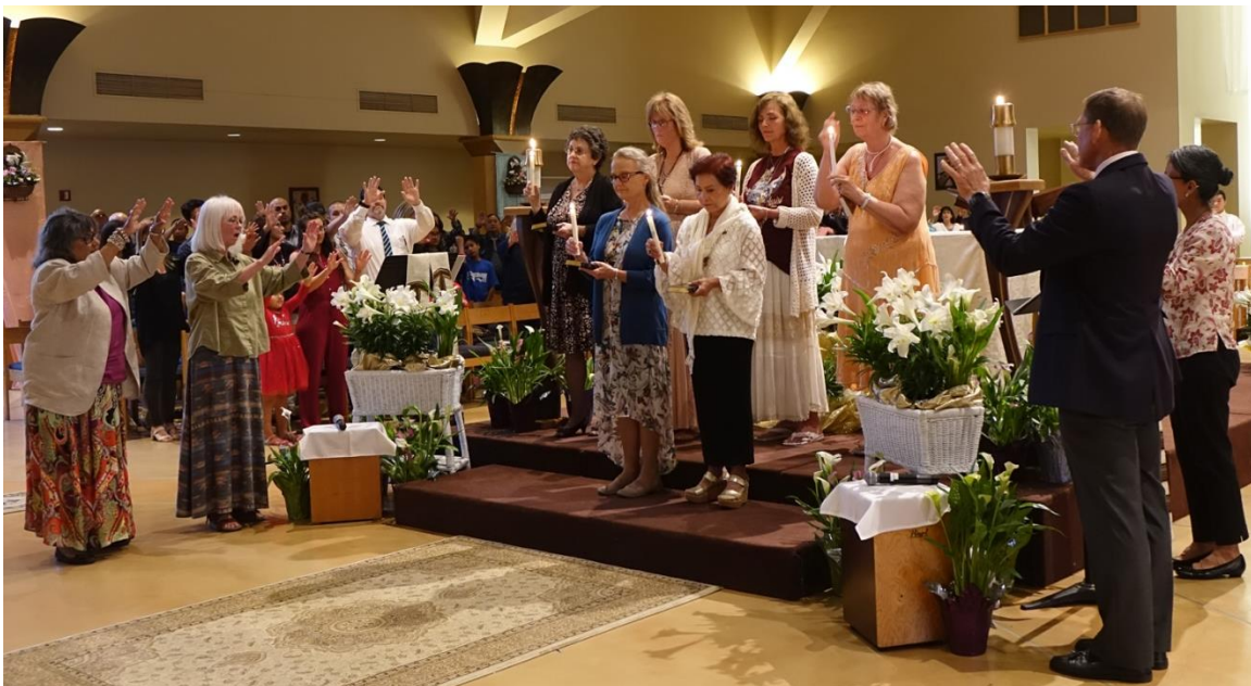
The Newly Professed with their Ministers.