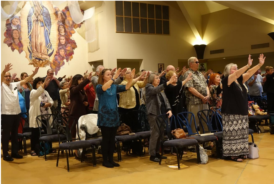
May the Lord Bless the newly Professed...