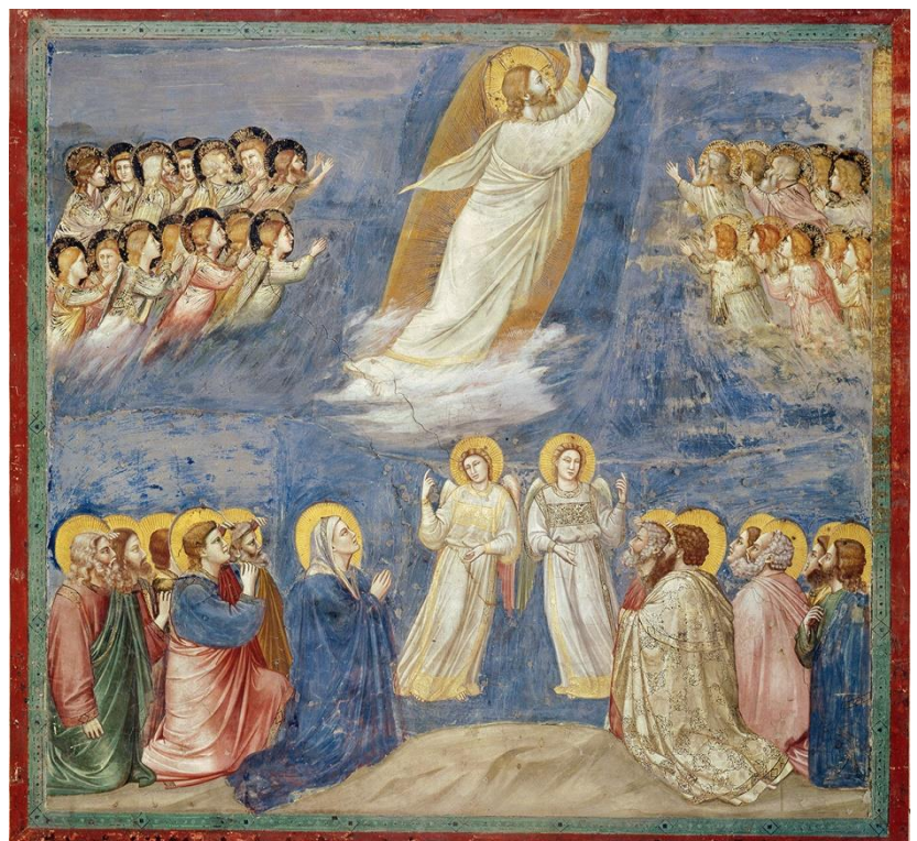
Image: The Ascension of Christ (1304-06), by Giotto (c.1267-1337).