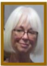
Minister Donna Foley, OFS