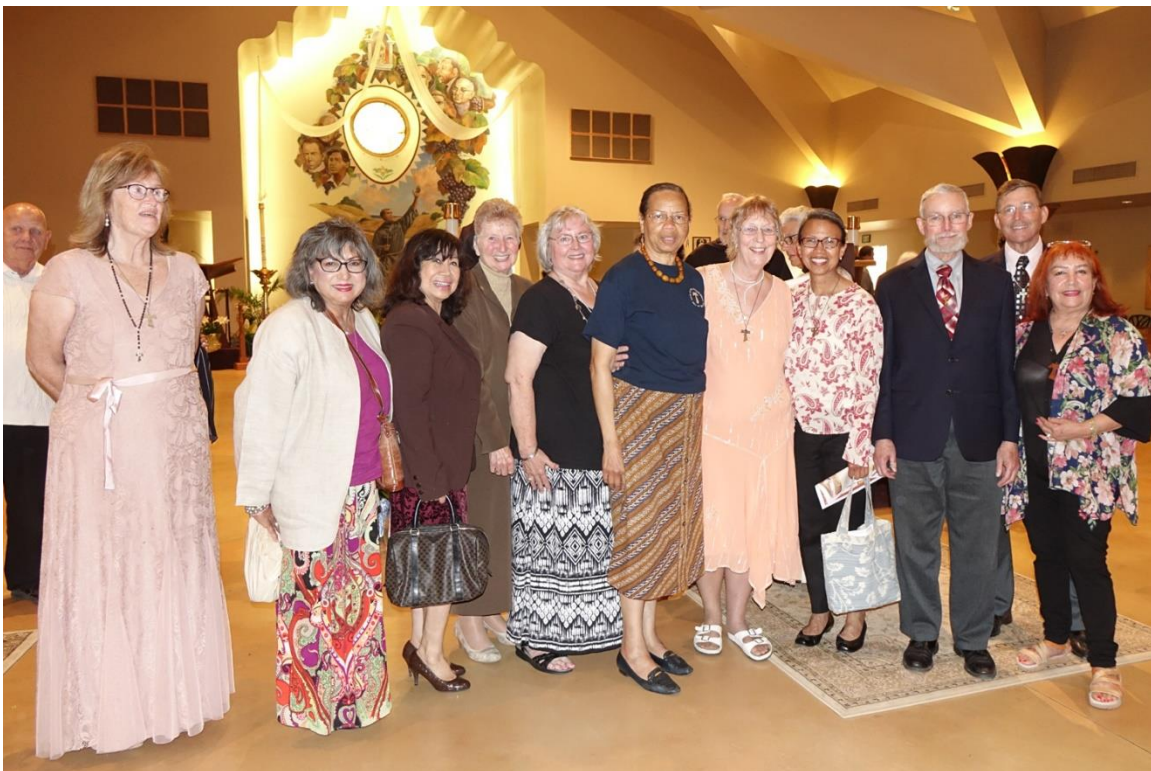
Many Happy Faces!!! Congratulations!!!

and then returned to Jerusalem with great joy, and they were continually in the temple praising God.