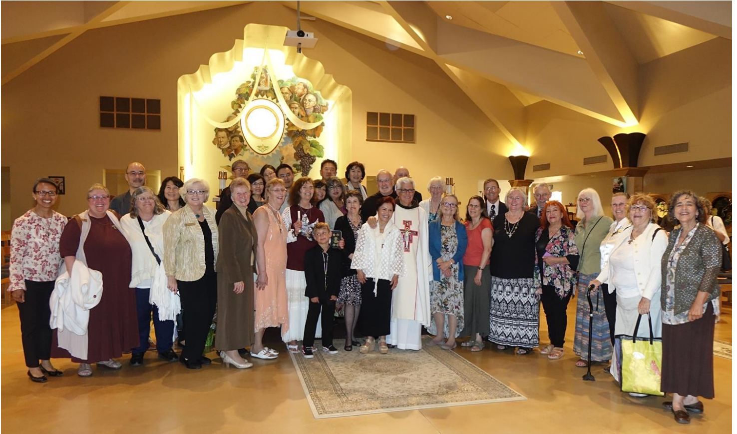
SLR members present... How many do you recognize?