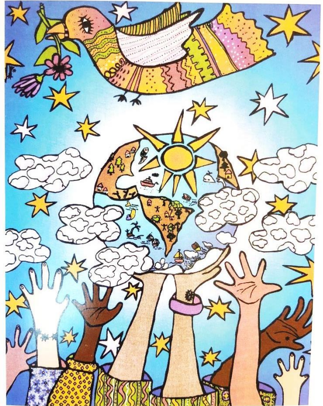
Peace on Earth