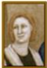
Vice Minister Karron Esmonde, OFS