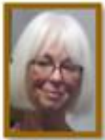
Minister Donna Foley, OFS