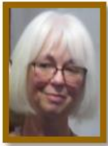
Minister Donna Foley, OFS