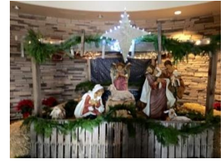
Christmas scene, Serra Center 2016