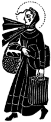
St. Elizabeth of Hungary

Responsory from the Office of Readings for the Feast of St. Elizabeth of Hungary: