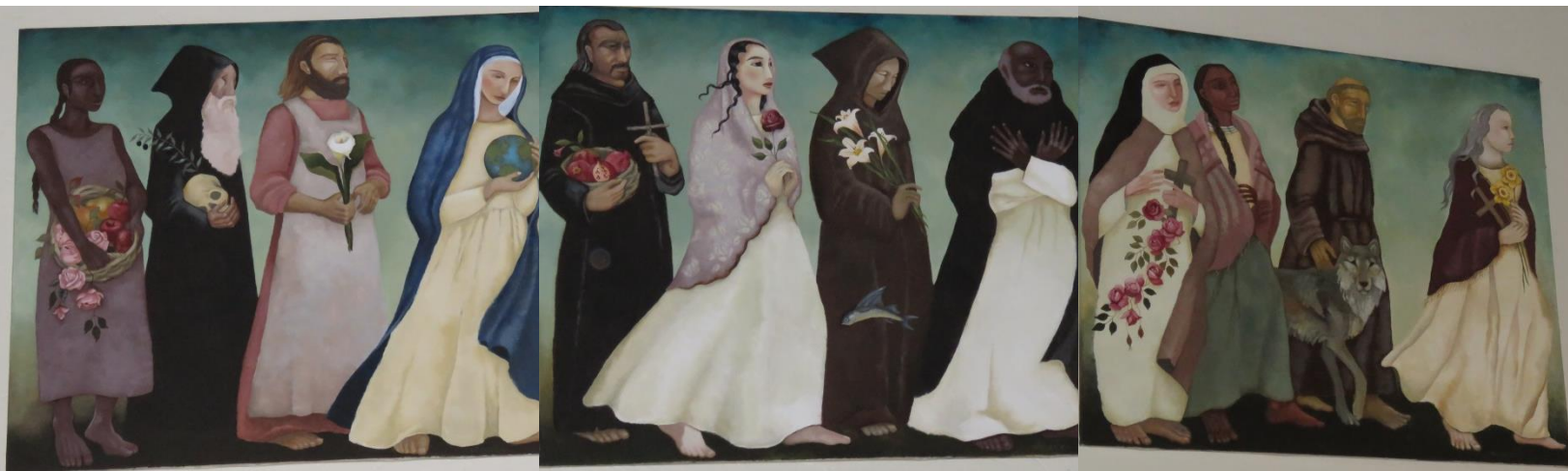
This is a shot of the group of three paintings on the west wall of the "Serra" room.

This beautiful icon is on the east wall of the 'Serra' room.