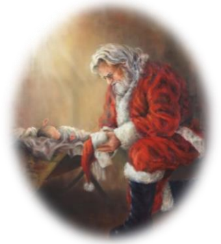
Santa kneeling at the Manger

San Luis Rey Fraternity of the Secular Franciscan Order Mission San Luis Rey, Oceanside, CA.