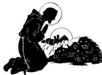
St. Francis adoring the Infant Jesus.

Don't remember where I got it, but just couldn't resist this beautiful picture of our Holy Father and St. Francis embracing. So beautiful.