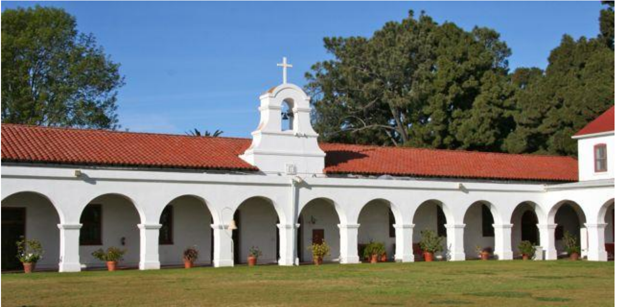
San Luis Rey Mission